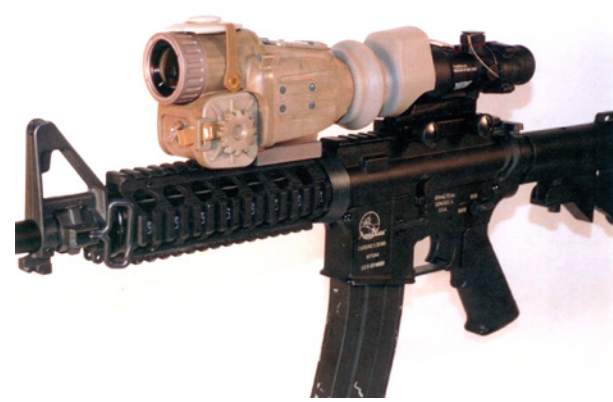
Shown in clip on configuration

INNOVATION IN ALL AREAS OF DISCOVERY AND DEVELOPMENT WITH PROGRAMS FOCUSED ON UNIQUE MILITARY NEEDS.