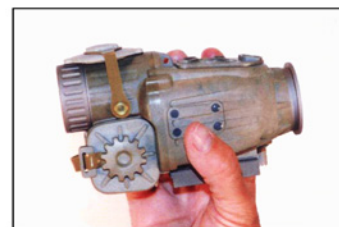
Hand Held configuration