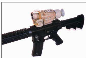
Stand Alone configuration